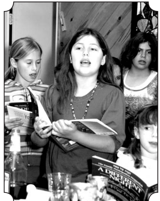
Passover 2009