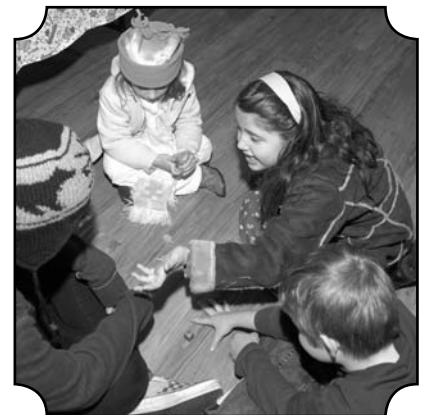
Hanukkah at CBI