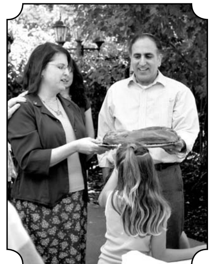
Blessing the Challah at Rosh Hashanah