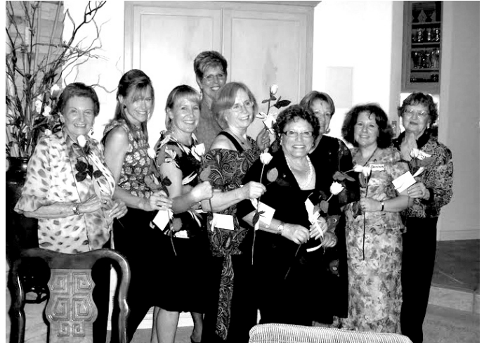
Past presidents of Haverot Sisterhood receive a white rose.

Our next event will be the annual “Dinner in the Sukkah” where we will celebrate Sukkot under the stars. The date is Wednesday, October 7th at 6 pm. Dinner will be potluck and you are asked to bring a vegetarian (dairy is ok) dish or a dessert for all to share. Make enough for about 6-8 so we can taste a little of everything. We will dine and celebrate in and around the sukkah. Sisterhood provides the coffee, tea and lemonade. By the time you receive this newsletter you will have received an announcement about the upcoming event. Haverot/Sisterhood has pledged a commitment to reaching out and helping those less fortunate in the community, and has donated a variety of items to local charitable organizations. As in the past we are asking each of you who attend the Sukkot potluck to donate items to