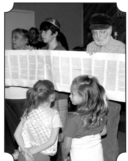
Simchat Torah