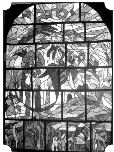
CBI Quilt, Made With Loving Hands