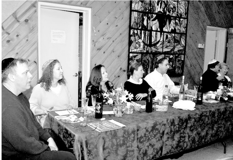
5770 Seder at CBI

Canyon Oaks will cater the elegant event, offering you a choice of two entrées, kosher chicken or vegetarian. In order to encourage family participation, the Rabbi's Discretionary Fund will cover the cost of