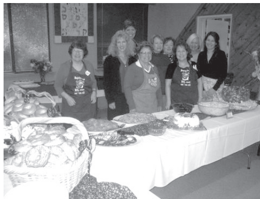
Bagel Brunch 2011

And I must say the new refrigerator came in handy for the Bagel Brunch! We were able to fit just about every