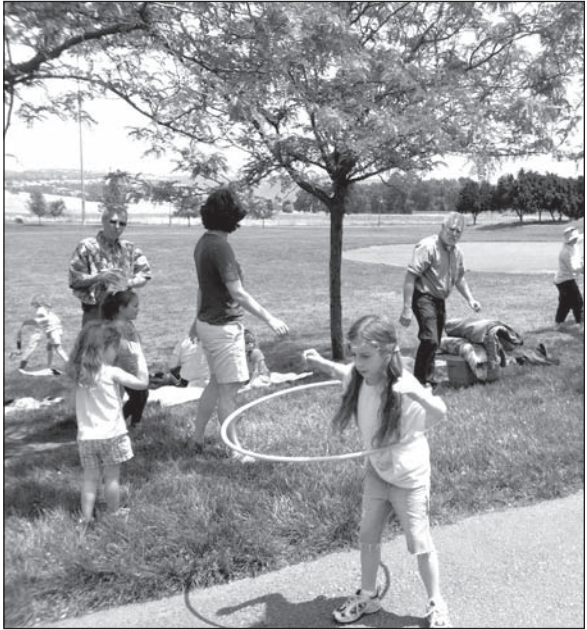
At the Lag Ba-Omer Picnic.